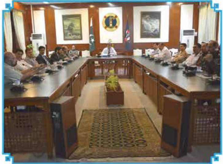
Meeting on Traffic Management Plan and Road-Rail Connectivity of PDWCP Project held at KPT Head Office on 19-04-2016