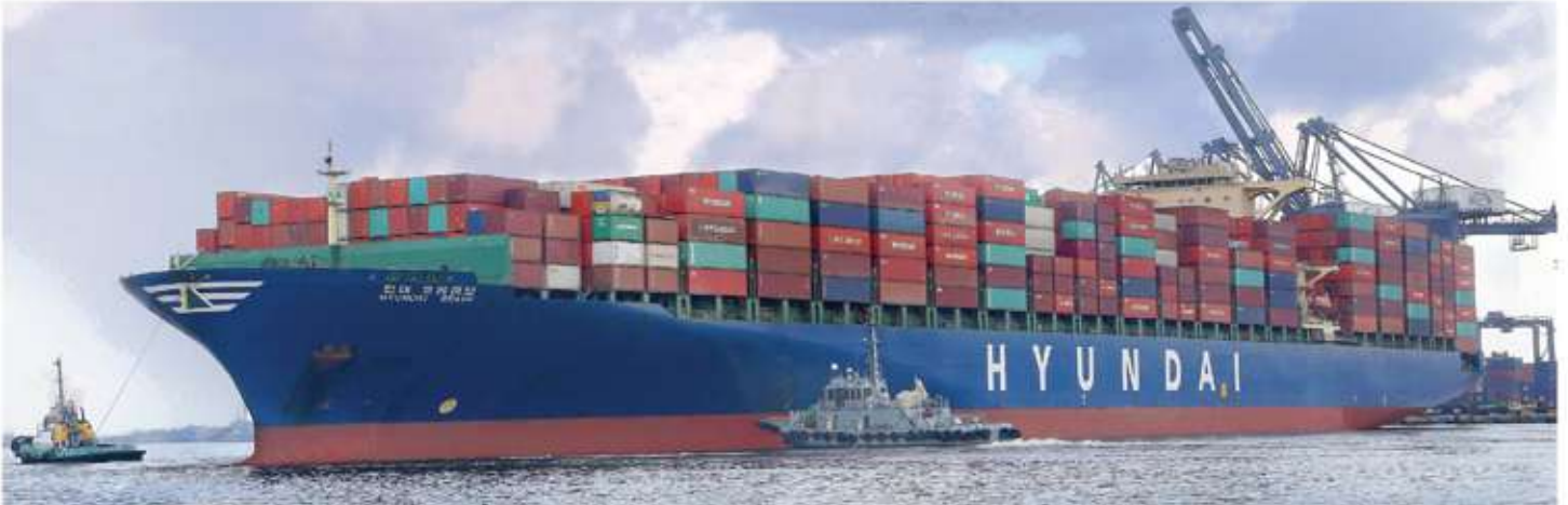
A PANAMA Container Ship MV HYUNDAI BRAVE having length 339.62 meters, Beam 45.64 meters, N.R.T 51638, G.R.T 94511, Agents M/s United Marine Agencies (Pvt) Limited, arrived at Karachi Port on 29th April 2016, while she sailed on 1st May 2016, the longest ever ship handled by Pakistani Port.