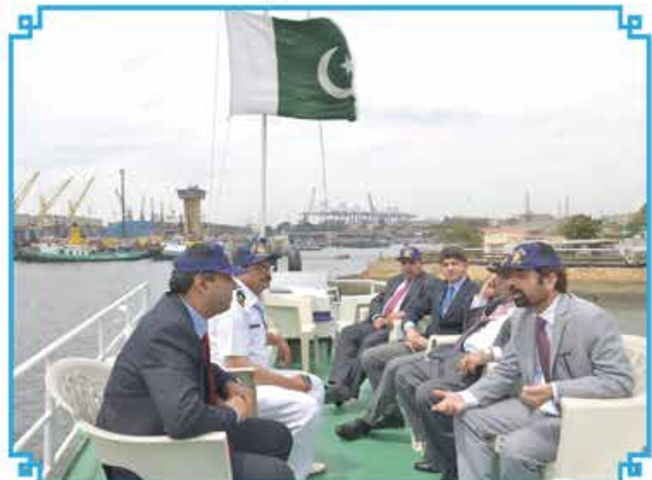
Pakistan Coast Guard delegation visited Pakistan Deep Water Container Terminal on 19-04-2016