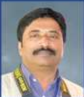
Zubair Ayyub Assistant Photographer