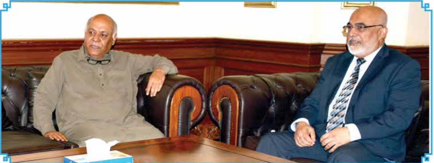
Federal Minister for Ports & Shipping Senator Mir Hasil Khan Bizenjo visited KPT Head Office on 22-06-2016