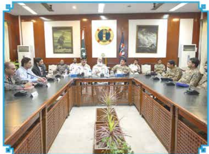
Army School of Logistic Kuldana Murree visited KPT Head Office on 26-05-2016