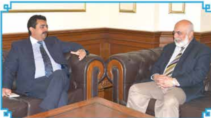
Ex-Minister of Ports & Shipping Senator Kamran Michael visited KPT Head office on 18-05-2016